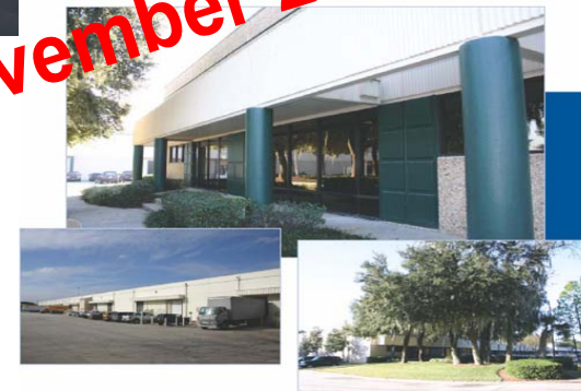
Region Center Lakeland, Florida

Denver Distribution Center - Denver, Colorado